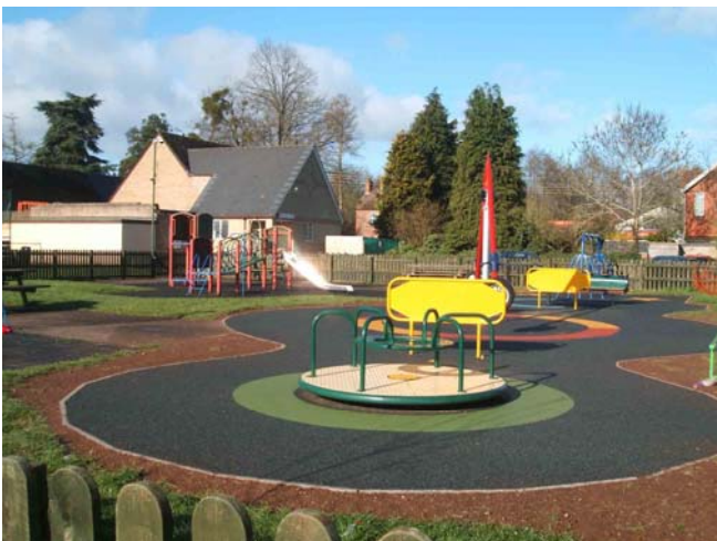
New equipment in Bishops Lydeard children's playground