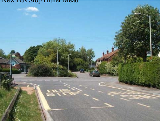
New Bus Stop Hither Mead

This has improved safety and convenience for bus users.