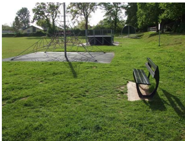
New bench on Cotford St Luke Playing Fields

The Parish Council gave a grant to Cotford St Luke Community Association to help with internal improvements in the hall. A new bench and litter bin were installed on the playing fields.